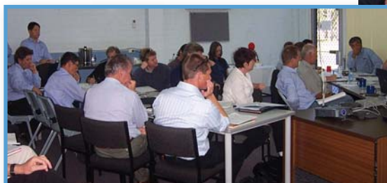
▲ Planning Focus Meeting ▶