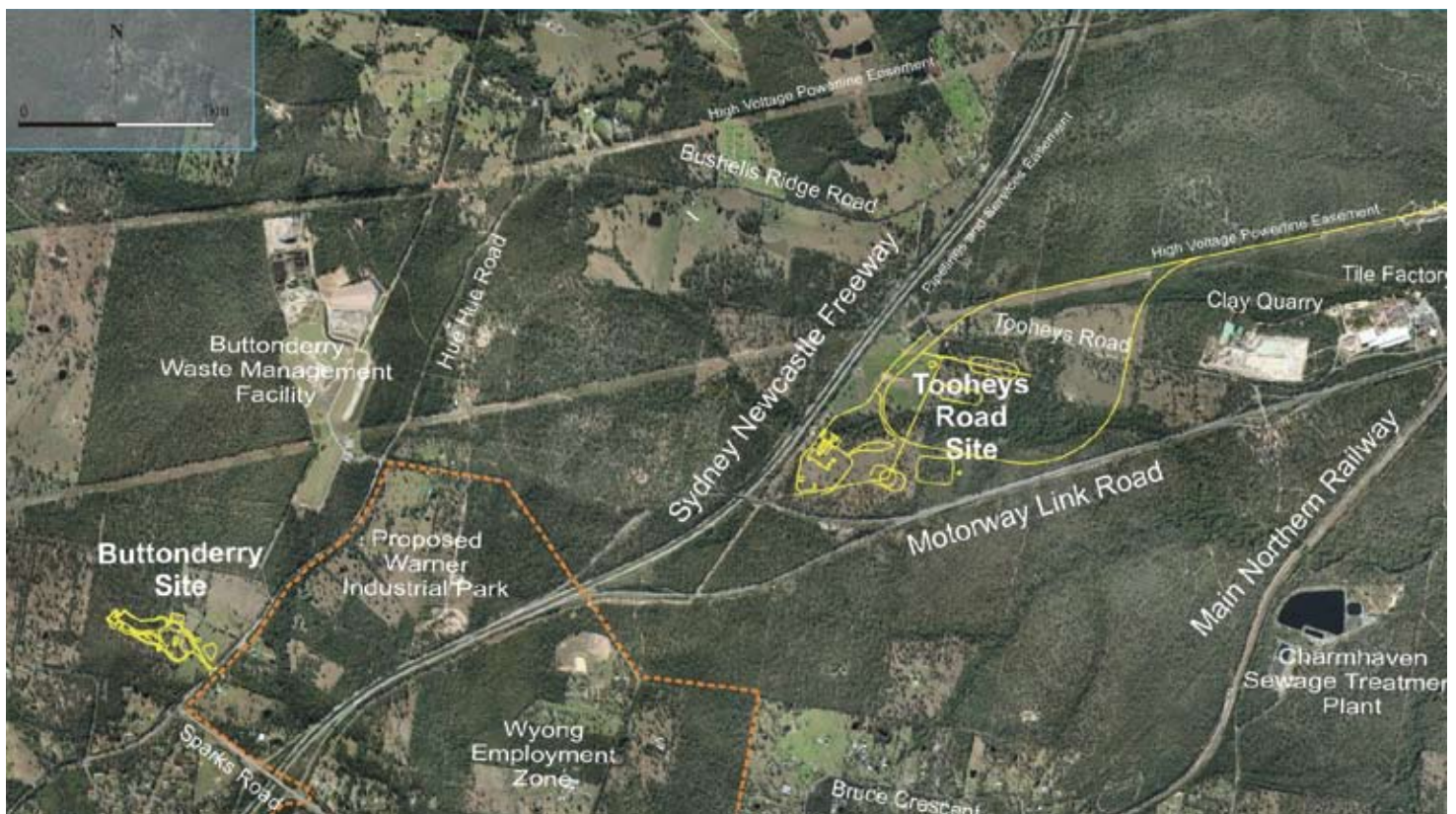
▲ Location of the W2CP "Tooheys Road" and "Buttonderry Sites":

Interested parties have until 2nd June 2010 to provide written comment and submissions on the Environmental Assessment Report.