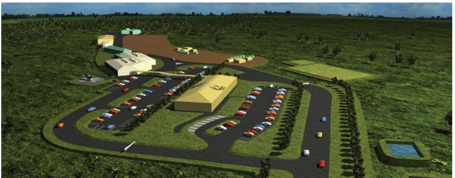
▲ Buttonderry Sites artist impression

Modelling has shown that the existing LA eq,24 hour levels would increase by 1.4dBA. The DECCW LA eq 24 hour 60dBA goal is satisfied at approximately 60 metres from the rail line. The LA max 85 dBA level is predicted to be satisfied at a distance of approximately 100 metres.